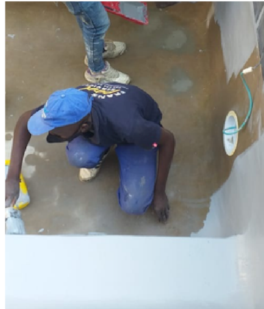
Apply the pool coats