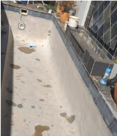
Prepare and patch